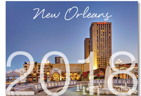
62nd Annual Conference July 18-21, 2018 Hilton Riverside Hotel and Convention Center New Orleans, Louisiana